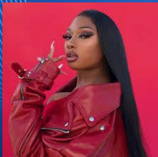
Megan Thee Stallion

Is an American rapper, singer, and songwriter. She first garnered attention when videos of her freestyling became popular on social media platforms such as Instagram.